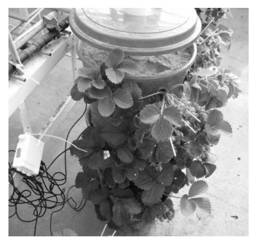
Figure 1. Column of stacked containers